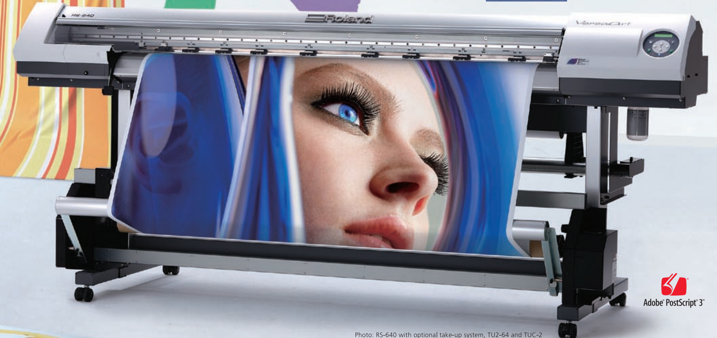
Photo: RS-640 with optional take-up system, TU2-64 and TUC-2